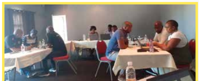
Delegates at the Train the Trainer Workshop

The modules are aligned to build up to the development of a business plan.