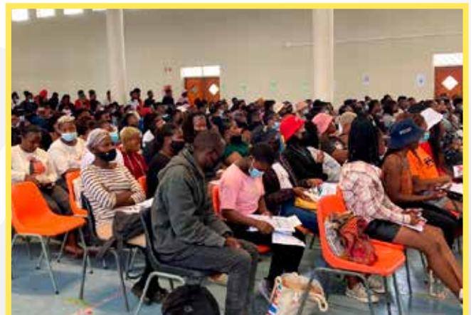
Students at the first 2022 Orientation in Dutywa Campus