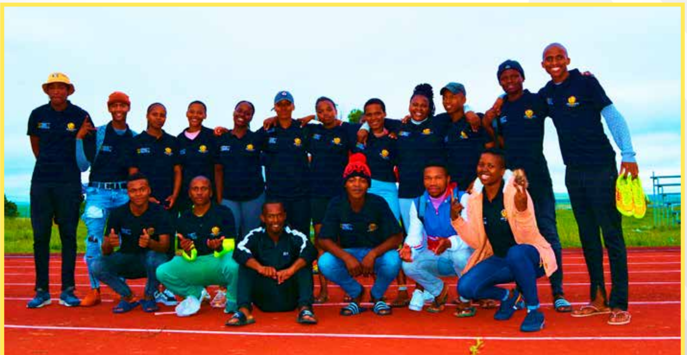
Team King Hintsa at Provincial Games