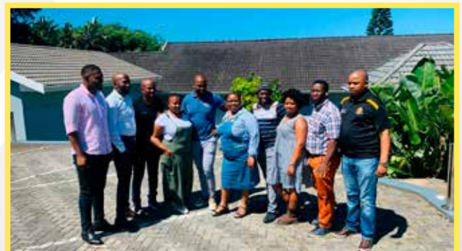
Train the Trainer Workshop in East London